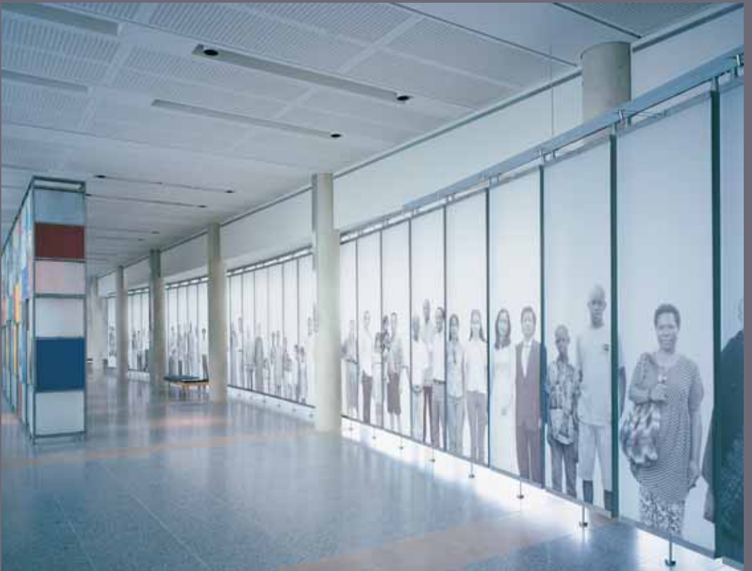
• ► The Pope John Paul II Visitor Center